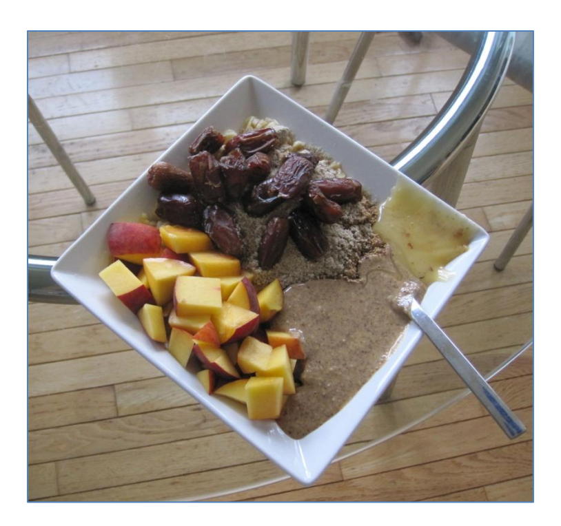
Mashed bananas, ground flax and sunflower seeds, dates, raw honey, raw organic almond butter and fresh peaches. A healthy Paleo "cheat."