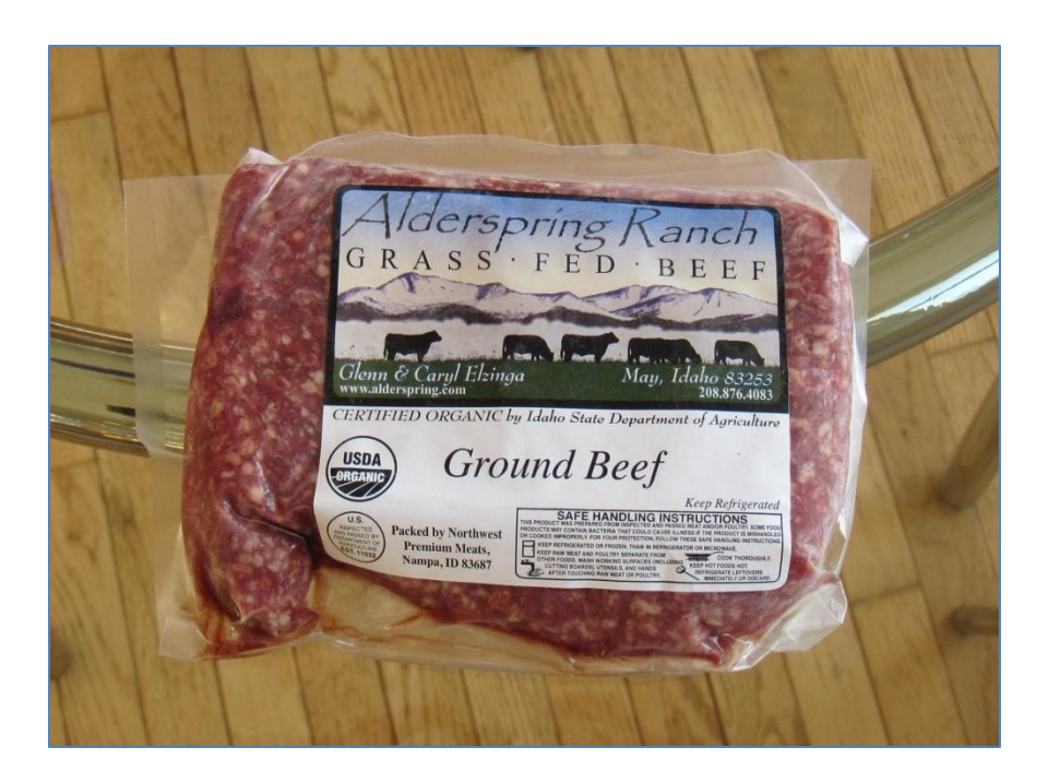
Grassfed organic beef from Alder Spring Ranch in May, Idaho.