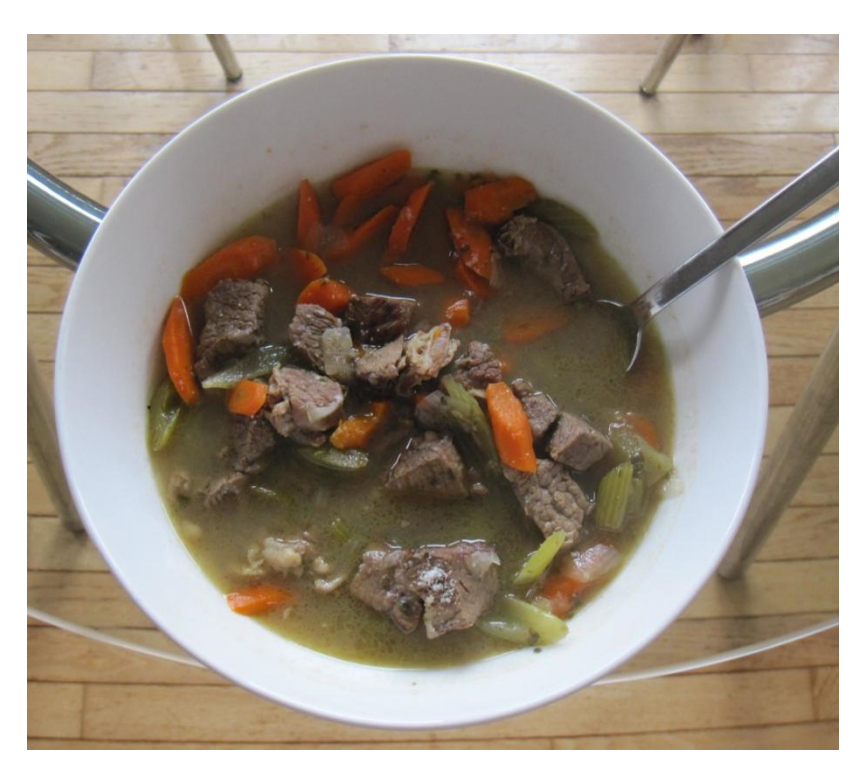
A very simple all-organic grassfed beef stew. Beef, carrots, onions, celery, garlic, parsley and water. That's it.